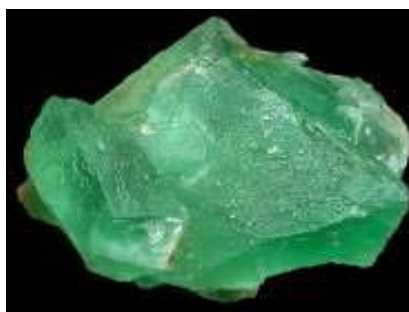
Fluorite from William Wise Mine, Westmorland, Cheshire Co., N.H.